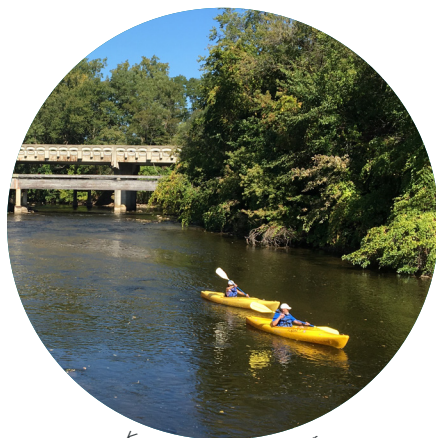
Kayakers enjoy the river.