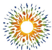
Fred A. and Barbara M. Erb Family Foundation

Data sources include: Centers for Disease Control and Prevention/Agency for Toxic Substances and Disease Registry; Detroit Bird Alliance/Audubon Society; Federal Emergency Management Agency; Friends of the Detroit River; Google Earth Engine; Huron River Watershed Council; Implan; Michigan Department of Environment, Great Lakes, and Energy; Michigan Department of Health and Human Services; Michigan Department of Natural Resources; Multi-Resolution Land Characteristics Consortium; National Oceanic and Atmospheric Administration; National Water Quality Monitoring Council; Trust for Public Land; U.S. Census Bureau; U.S. Environmental Protection Agency; U.S. Geological Survey; and Your Economy. To find more information about the data and analyses used, please refer to the methods report.