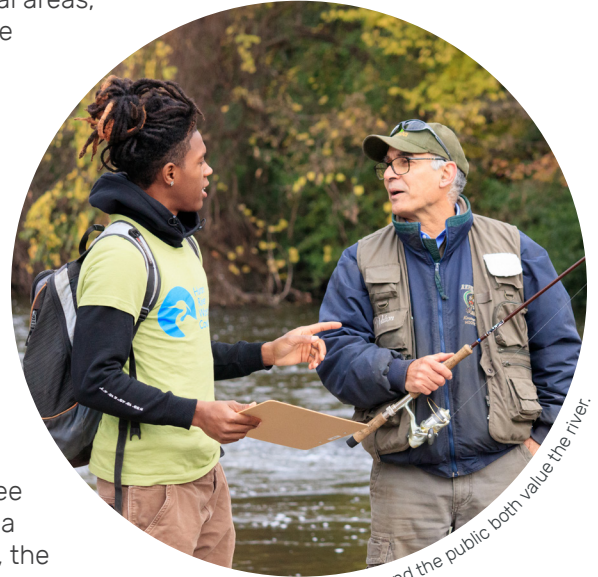
Scientists and the public both value the river.

Michigan's earliest residents were largely affiliated with the Algonquin nation. This migratory population came to organize themselves into three major tribal cultures—the Ottawa, Chippewa, and Potawatomi—forming a loose confederation known as the Three Fires. A fourth group of people, the Wendats (Wyandots), settled in southeastern Michigan. Both the Wendats and the Potawatomi established permanent or semi-permanent villages along the Huron River.