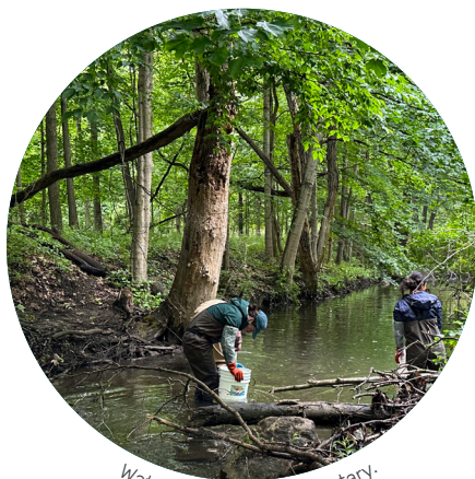
Water sampling in a tributary.

Southeast Michigan is home to nearly half of all Michiganders. The region’s inland lakes and streams are critical to the health and the quality of life of residents. Coordinated and significant federal, state, and local investments in freshwater are needed to improve these natural resources for the benefit of people and wildlife.