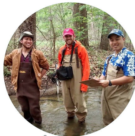
Collecting water data.