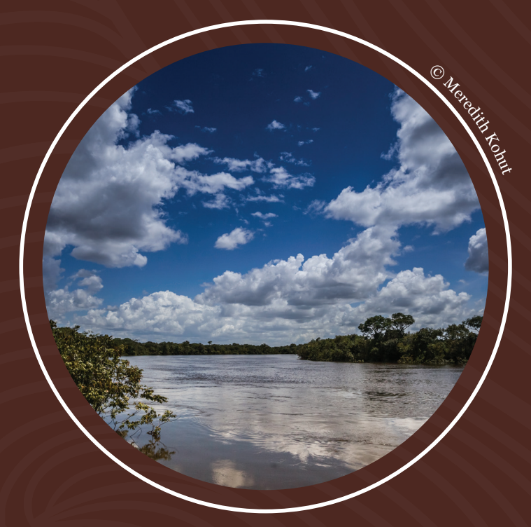
The landscape of the Vichada River.

The Vichada Basin is a place of great cultural diversity where farmers and indigenous communities of the Guahibo, Piapoco, Cubeo, Curripaco, Piaroa, and Puinave ethnic groups live on expansive green savannas. Over the last decade, the number of oil and gas wells drilled each year in the Rubiales oil field, located 167 km from Puerto Gaitan, has increased almost 50-fold, placing unprecedented pressure on the western portion of the Vichada River Basin. With a current production rate of 264,000 barrels per day, the Rubiales oil field is one of the largest in Colombia. The expansion of this industry has resulted in the rapid development of road infrastructure, expansion of towns, job production, migration to the region, and a rise in land ownership conflicts. Proper land use planning and benefits sharing mechanisms are urgently needed in this region to improve sectoral planning and avoid adverse environmental and social impacts.