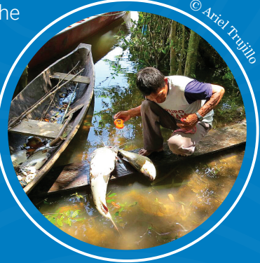
Fish monitoring in Tuparro National Park.

in the park. In 2013, due to the success of the monitoring program, UNESCO supported a pilot project to broaden indigenous community participation in the program. By 2020, it seeks to involve 11 more communities in the characterization and protection of biodiversity.