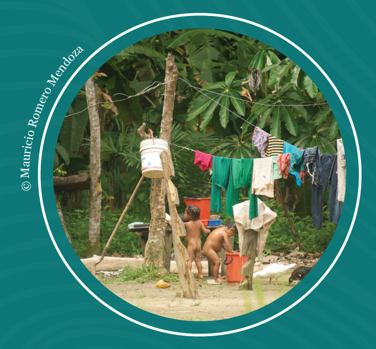
An indigenous village in the Matavén.