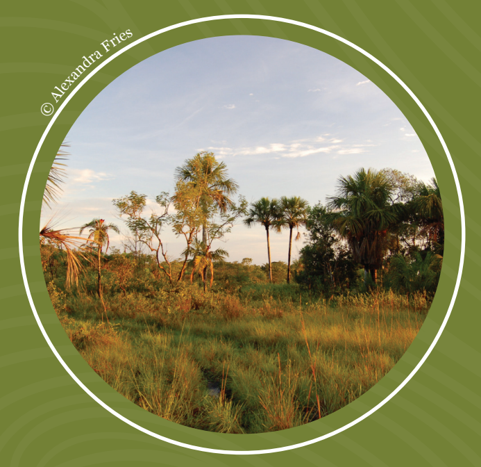
La Lindosa Reserve is an important protected area.

In La Lindosa, 225 families have committed to conservation and protection of natural resources by adopting sustainable practices such as organic agriculture, stabled livestock, and ecotourism. They formed the Corporation for the Conservation and the Sustainable Development of La Lindosa's Range and its Influence Area - CORPOLINDOSA in 2006. These families face the challenge of restoring once forested ecosystems affected by the expansion of agriculture, illicit crops, and induced fires. They fight to conserve six micro-watersheds, 297 brooks, and 290 headwaters that flow through the department.