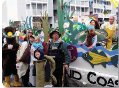
Community enthusiasm earned MCBP the coveted first-place trophy in the Ocean City St. Patrick's Day Parade in 2009.