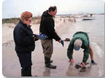
Hundreds of volunteers assist MCBP throughout the year by tagging horseshoe crabs, searching for reptiles & amphibians, counting birds, and cleaning up our community.