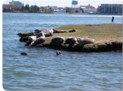
Harbor seals rest and sun themselves on bay islands—a critical habitat for many species.