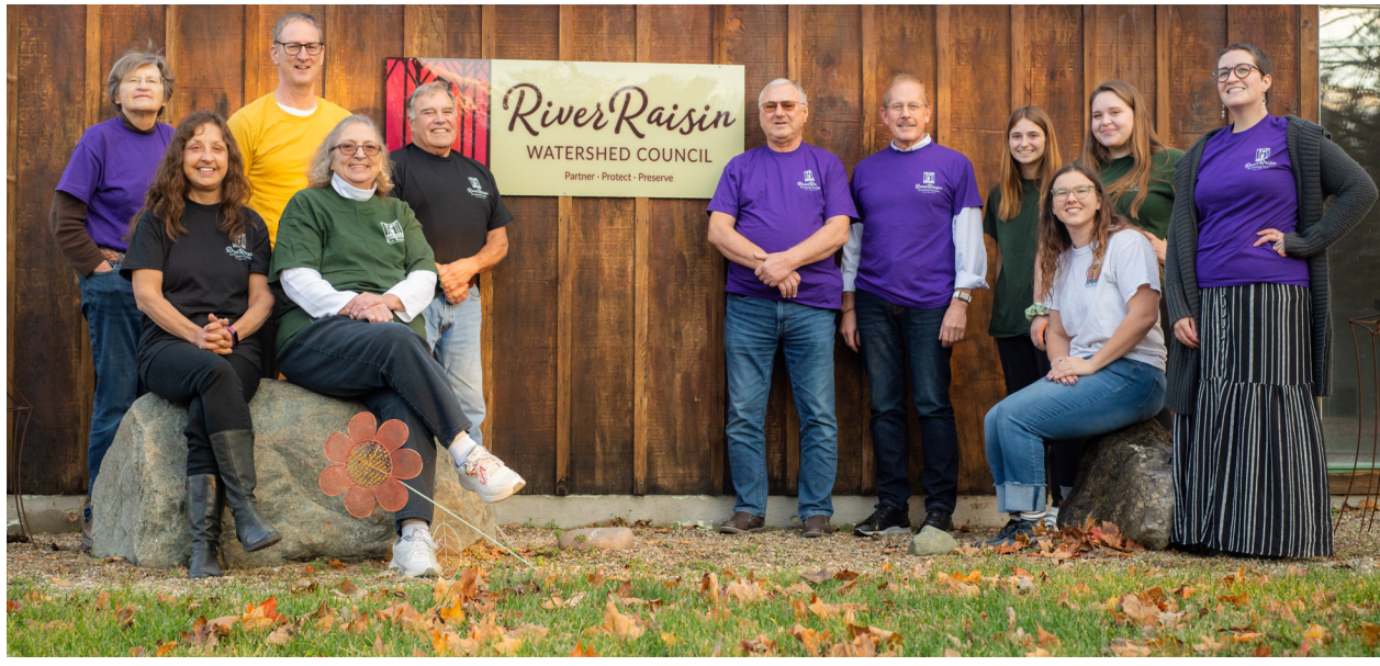
The members of the River Raisin Watershed Council.

The watershed council achieves these goals by working with partners on various activities, including classroom and public education, outreach to farmers, water quality monitoring, volunteer cleanups, and encouraging recreation on the river. Through these actions, the organization strives to promote and foster an understanding of the connection between our quality of life and the health and well-being of the watershed. To learn more about the vital work the RRWC does in the River Raisin watershed, visit RiverRaisin.org,